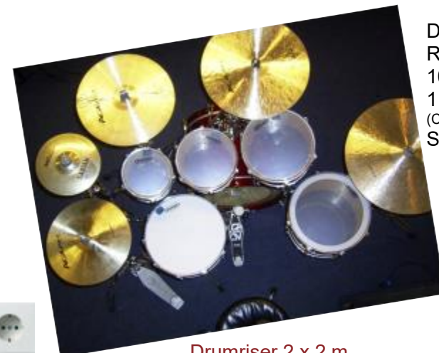
Drumriser 2 x 2 m

DRUMS Richy 10 x Mic 1 x Pad D.I. (Chan 1 - 11) Signal XLR (AUX 9+10) (AUX 6)